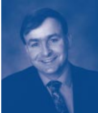
Foreword by the Minister for Education and Science, Mr. Micheál Martin, TD

Schools are unique communities bringing together diverse individuals in order to help children develop to their full potential. Schools face many challenges and planning to meet these challenges is a vital part of the school's work. These Guidelines have been developed and published to help with this task.